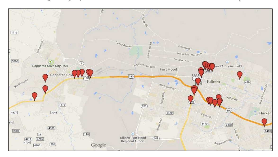
Map of Payday and Auto Title Store Locations in Fort Hood Vicinity

The map below shows, the locations of the 28 payday and auto title businesses within close proximity of Fort Hood. The chart on the following page details products and rates offered by the locations surveyed.